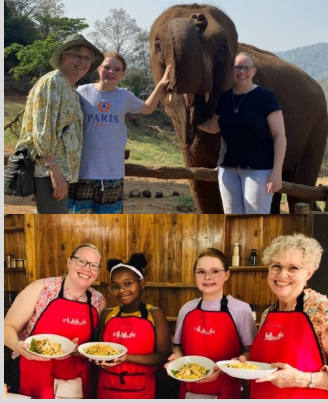
Enjoying time with my mom & sister