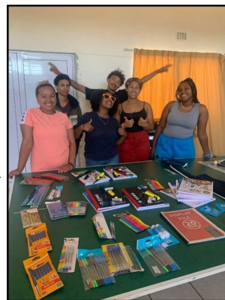
Grateful students with their stationery packs from the men's group at SC

Students and Board of Grace Learning Space